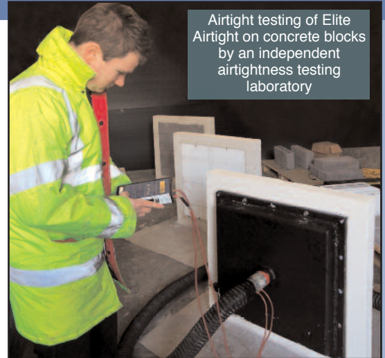
Airtight testing of Elite Airtight on concrete blocks by an independent airtightness testing laboratory

Touch dry: 2 Hours @ 18°C Recoat: 6 Hours @ 18°C